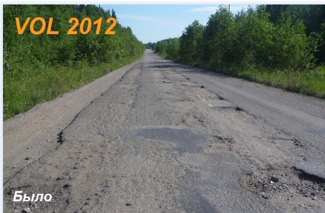
Roads condition in 2012